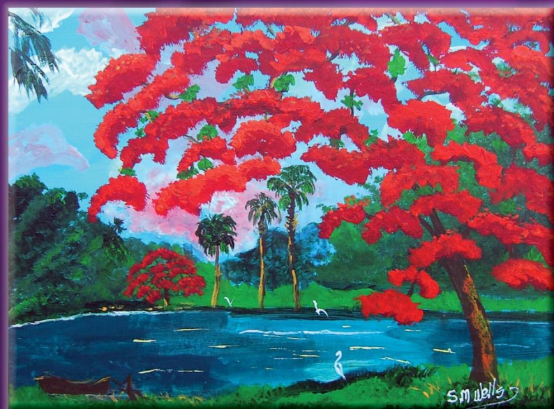
"In The Garden"