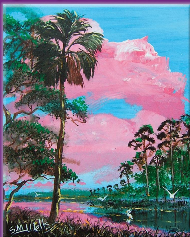
Indian River 16" x 20"

Sylvester M. Wells is one of the original 26 African-American painters known collectively as the "Florida Highwaymen," who, from the 1950's to the 1980's, painted scenes of Florida's early undeveloped and unspoiled coastal landscapes and sold those paintings out of the trunks of their cars along central and eastern Florida's