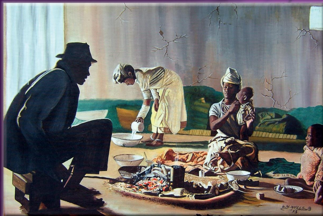
"South African Hut"